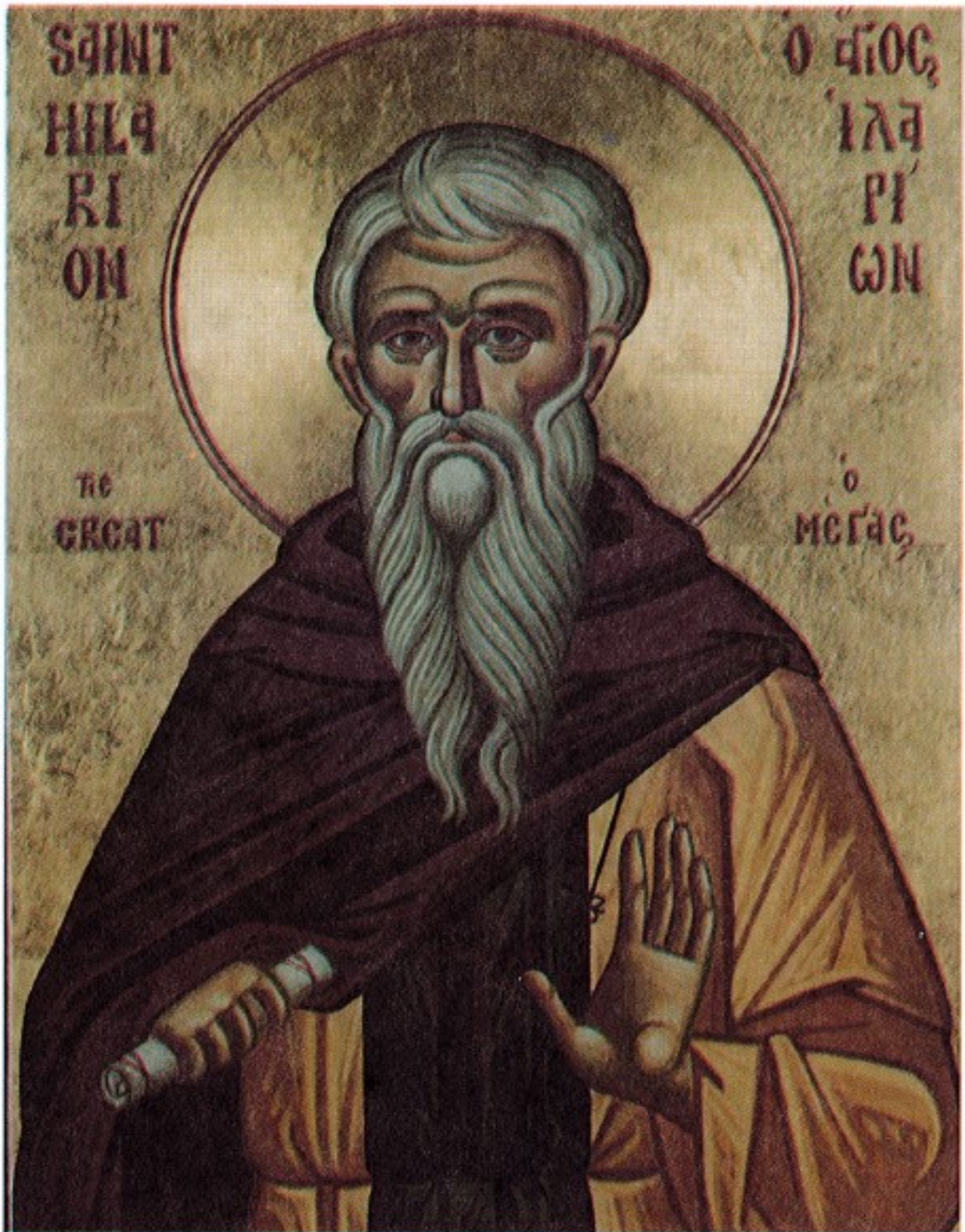
October 22, 2023 — 6th Sunday of Luke